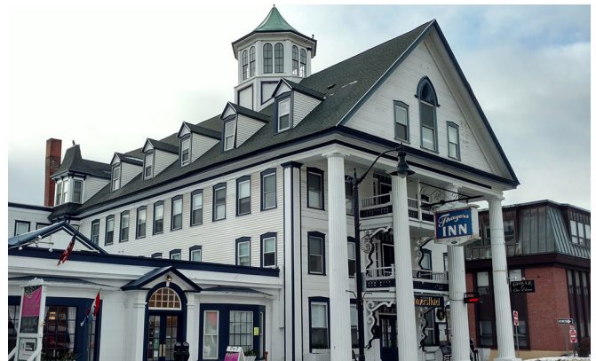
Above: The Thayer's Inn

New Hampshire's LCHIP program makes matching grants to NH communities and non-profits to conserve and preserve the state's most important natural, cultural, and historic resources. LCHIP works in partnership with municipalities and non-profits to acquire land and cultural resources, or interests therein, with local, regional, and statewide significance. This program provides a funding mechanism for towns to leverage for historic building or site preservation projects.