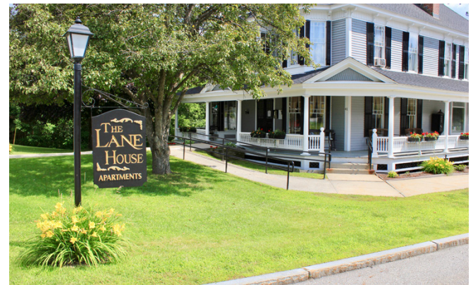
Above: The Lane House