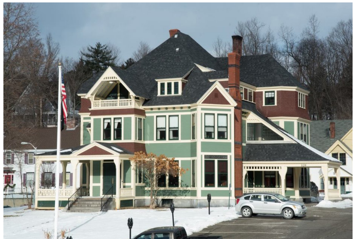
Above: Littleton Community Center