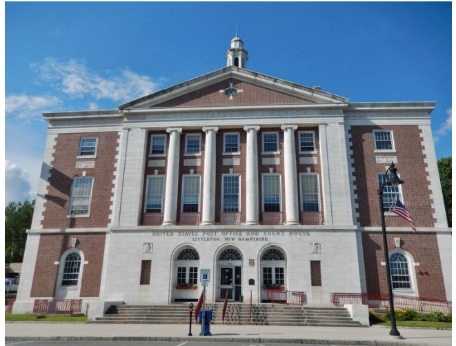
Above: The historic post office building