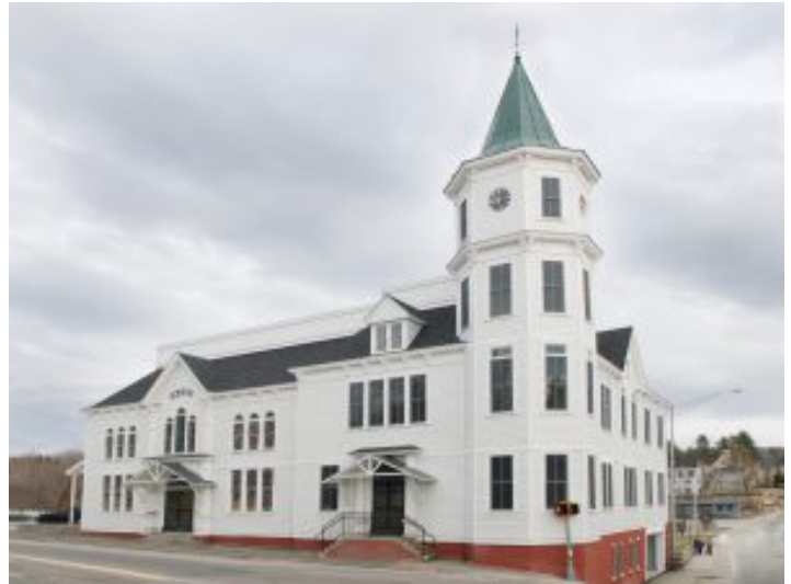
Above: Littleton Opera House

The National Register of Historic Places is the official list of the Nation's resources worthy of preservation . The Register lists properties of local, state, and/or national significance in the areas of American history, architecture, archeology, engineering, and culture. Resources may be nominated individually, or in groups, as districts or as multiple resource areas and must generally be at least 50 years old. Listing on the Register can make a property eligible for certain federal tax benefits, but does not interfere with a property owner's right to alter, manage, dispose of or even demolish their property unless federal funds are